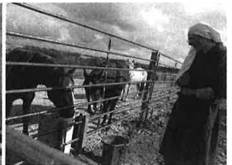
Therapy horses are here!

May God bless and reward you, you are in our prayers, and we hope to see you on May 30th!