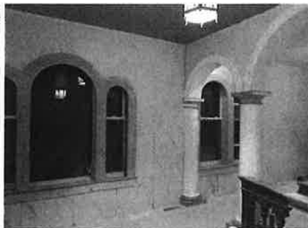
Chapel under construction